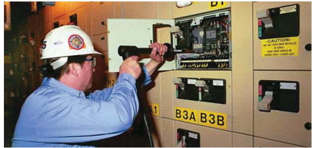
MCCB testing using the HCP2000